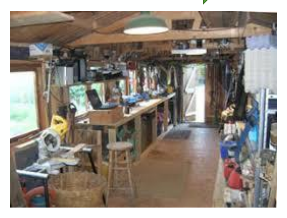
You can work here ....