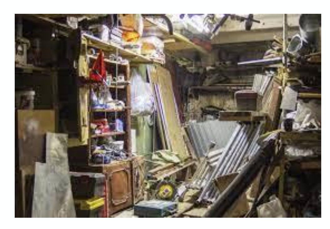
Data is a mess, unlinked, haphazard useless